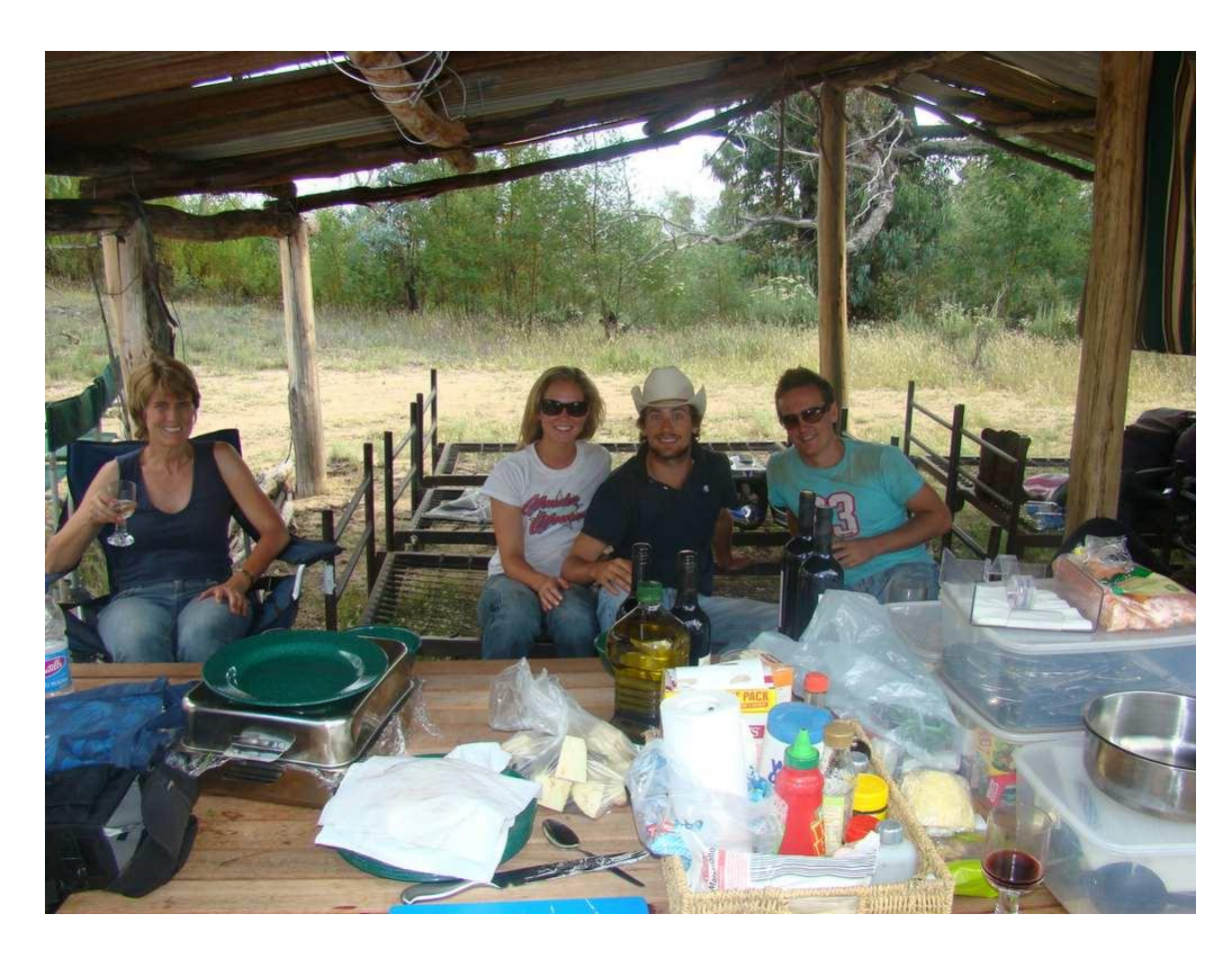
Our Wilderness Camps are really great fun