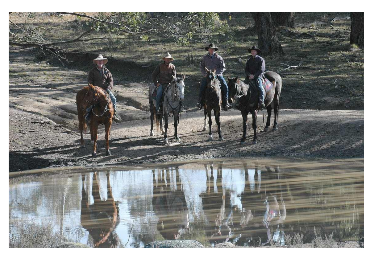
Riders at the lake

Then it is a long descent through native pine (Murray Pines) forests all the way down into Reedy Creek where we have a lovely lunch spot.