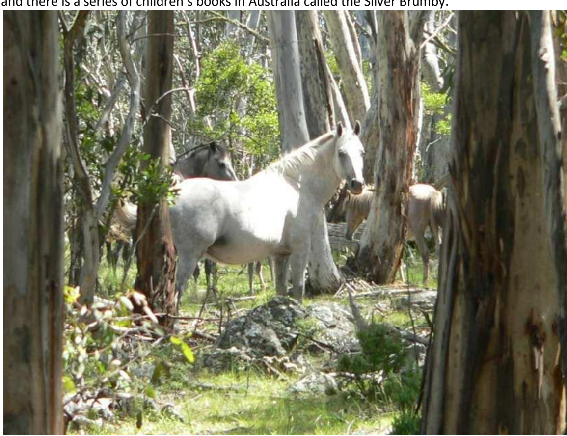
Our magnificent Silver Brumby

After lunch, the ride sets off in search of the Silver Brumby Mob. Led by a silver grey Waler stallion, this mob has mares who are different shades of grey and can be quite elusive, weaving through the grey snow gum trees. The Silver Brumby is a majestic horse and there is a series of children's books in Australia called the Silver Brumby.