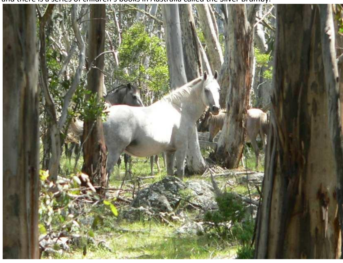
Our magnificent Silver Brumby

After lunch, the ride sets off in search of the Silver Brumby Mob. Led by a silver grey Waler stallion, this mob has mares who are different shades of grey and can be quite elusive, weaving through the grey snow gum trees. The Silver Brumby is a majestic horse and there is a series of children's books in Australia called the Silver Brumby.