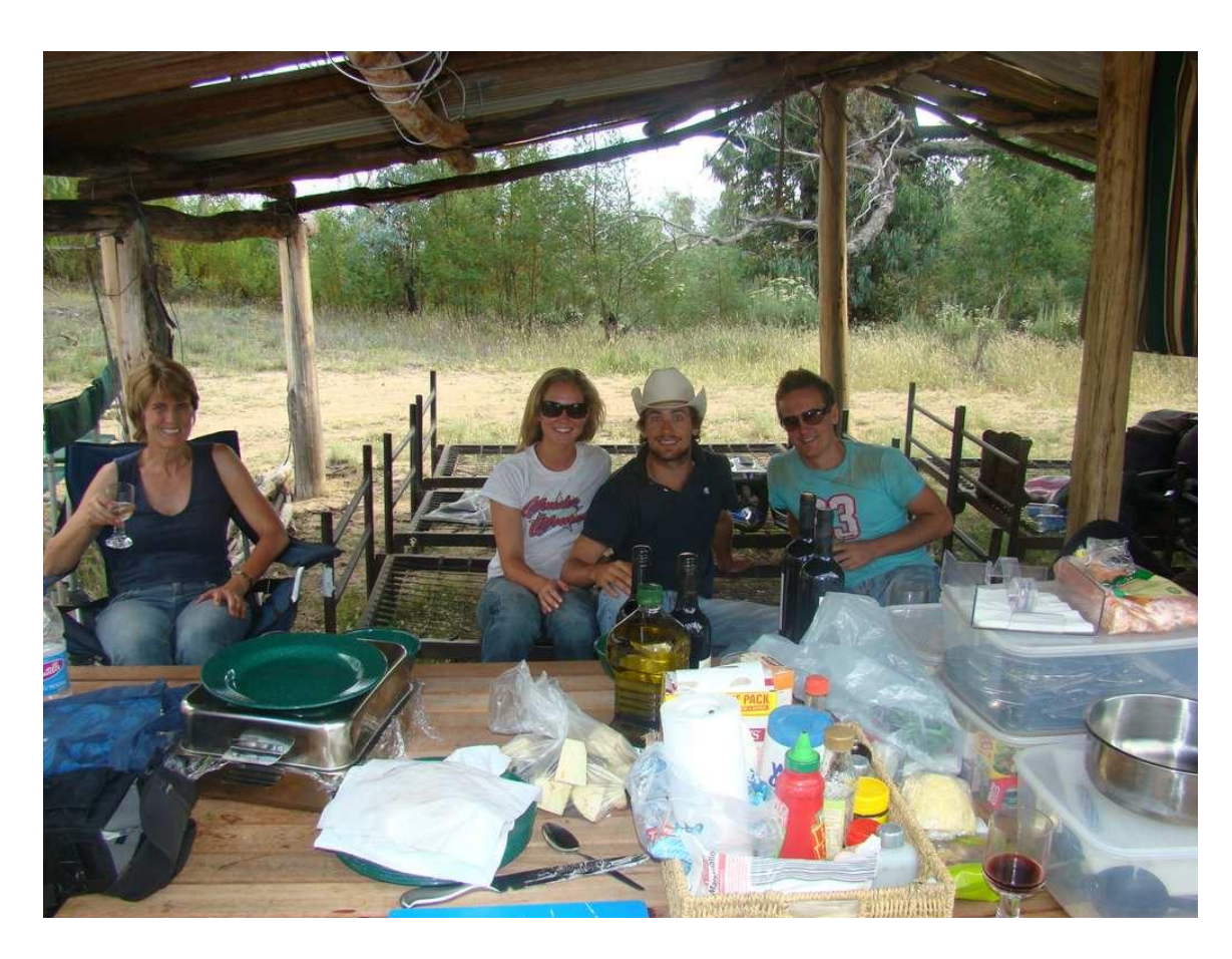
Our Wilderness Camps are really great fun