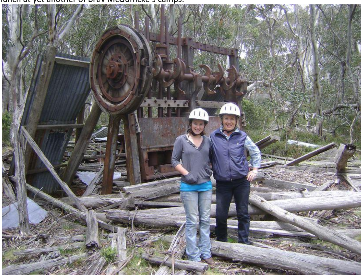
The Ore Crusher

The ride begins with a long climb west across spurs and through a beautiful valley of tall gum trees we call the "Big Trees" to the top of a fire trail. This is quite steep riding, but the views at the top of Round Flat (1,600 meters) are stunning. The ride then continues down a gentle slope called Long Plain which provides us access to the Little Boggy which is an alpine frost plain of beautiful open meadows and fast running creeks. We have lunch at yet another of Bruv McGufficke's camps.